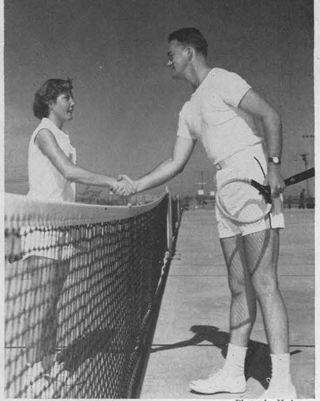
IT WAS A GOOD GAME and in traditional style the winner (we won't say who he was) shakes hands with the loser. Now for a refreshing swim. Ahhhhh, youth!